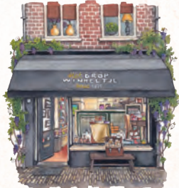
Het Dropwinkeltje Sneek, the Netherlands