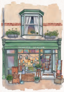
Maker Maker Exeter, UK

In this book you will find 45 charming and enchanting shopfronts to colour in. All of the illustrations are based on real buildings, located all around the world. Want to visit your favourites? Here is where you can find them: