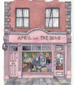
April and the Bear Dublin, Ireland