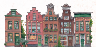
Urban Amsterdam Amsterdam, the Netherlands