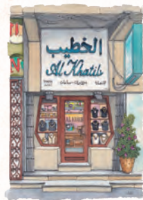
Al Khatib Jewellery Dubai, UAE