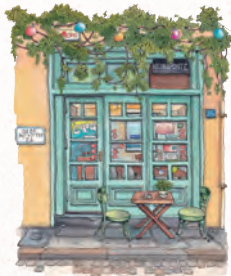
Negroponte Thessaloniki, Greece