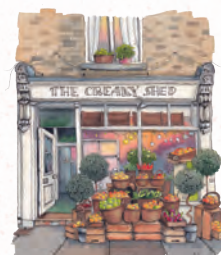
The Creaky Shed Greenwich, UK