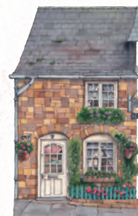
Rose Cottage Frome, UK