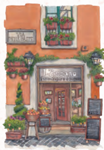
L'Arcano Rome, Italy