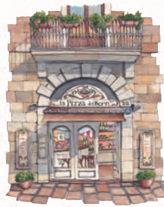
La Pizza del Born Barcelona, Spain