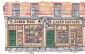
Laird Hatters Covent Garden, UK