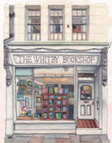
The Whitby Bookshop Whitby, UK