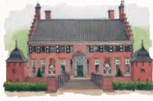
Menkemaborg Uithuizen, the Netherlands