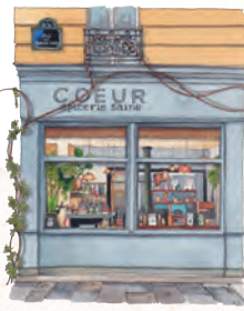
Coeur Paris, France