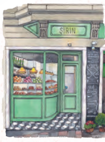
Sirin Firin Istanbul, Turkey