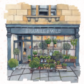
Bramble & Wild Frome, UK