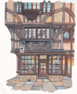
Laird Hatters Oxford, UK