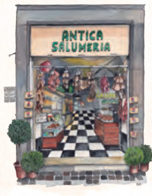
Antica Salumeria Rome, Italy