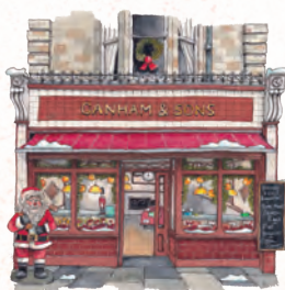
Canham & Sons Brighton and Hove, UK