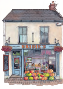
Bridie's Bar & General Store Kilkenny, Ireland