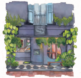
Flowers in the Window Johor, Malaysia