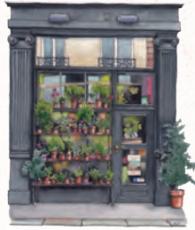
La Boutique des Saints Paris, France