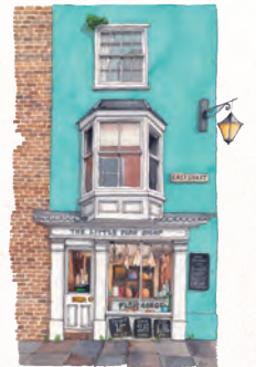
The Little Fishshop Southwold, UK