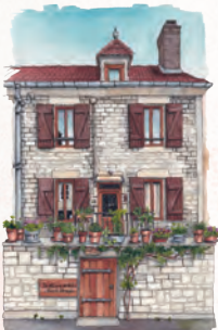
Rapha House Arcy-sur-Cure, France