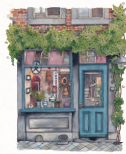
Villa Trèpetie Maastricht, the Netherlands