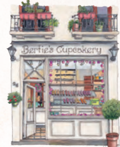
Bertie's Cupcakery Paris, France