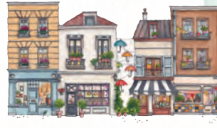
Urban Paris Paris, France