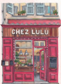
Chez Lulu Aix-en-Provence, France