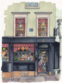
Scriptum Oxford, UK