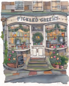
Pickled Greens Bath, UK