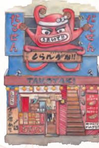
Takoyaki Osaka, Japan