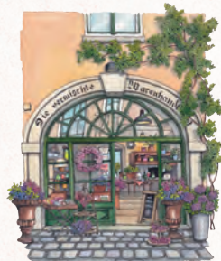
Die Vermischte Warenhandlung Vienna, Austria