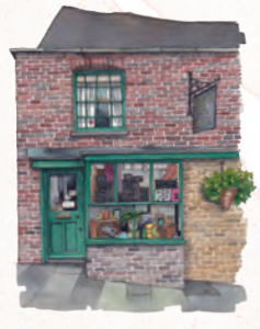
Savia & Cox Rye, UK