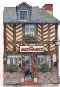
Le Normandie France